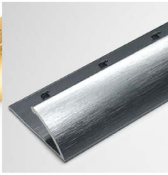
BRUSHED IRON GREY