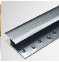
BRUSHED IRON GREY