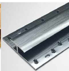
BRUSHED IRON GREY